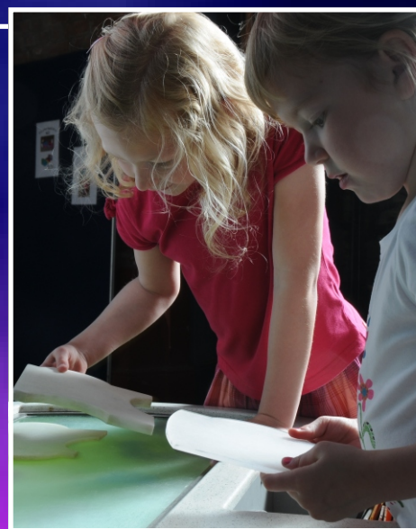
Here's what some of our partners say about working with Catalyst